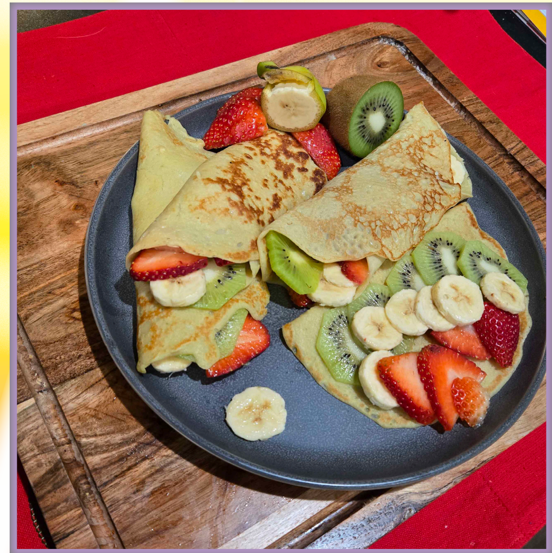
(crepes are deconstructed to show filling in photo)

guest recipe written by Brian and perfected by Alice Ontheshouldersofgiants